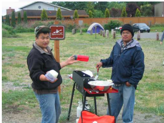
Each year, students participate in an adventure expedition, putting their skills to use.