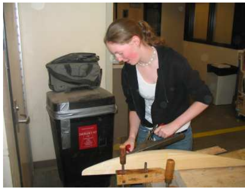
Students learn ancient skills with modern applications